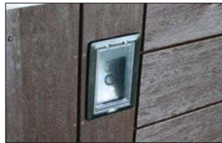
Bluetooth Docking Station

(STB) Bluetooth Audio with Dock (STI2) Infinity™ AM/FM / Bluetooth Audio Circulation Pump LED Jets White Palm Features Includes filter well LED lights