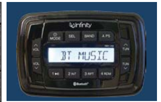
Infinity™ Audio System